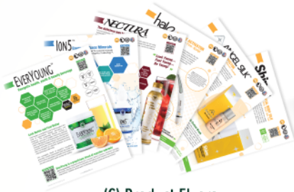
(6) Product Flyers

Note: The Business Builder Pack can also be purchased by existing Sparkle VIPs for $30.