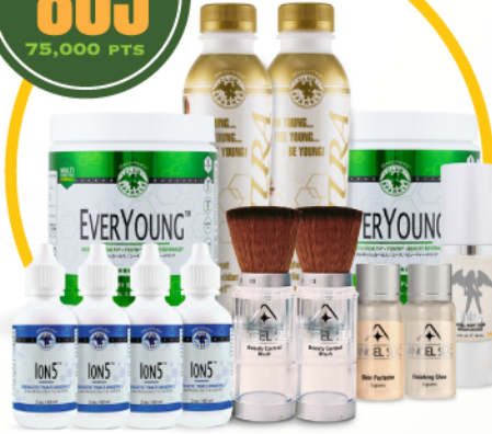
(2) EverYoung + (2) Nectura + (4) ION5 + (1) Shine + (1) Skin Perfector + (1) Finishing Glow + (2) Beauty Control Brush

Free Shipping & Membership Fee Included ( $45 Value )