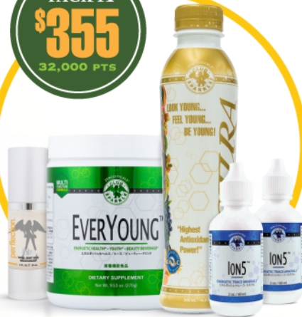
(1) EverYoung + (1) Nectura + (2) ION5 + (1) Shine