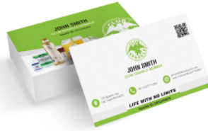
(100) Customized Business Cards