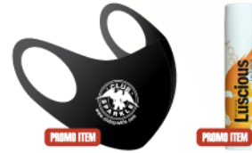
(1) Sparkle Mask (1) Sparkle Lip Balm

Plus: Tri-fold Brochure + Rack Card Brochure + VIP Application + Sparkle Folder